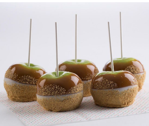
Apple Pie Caramel Apples